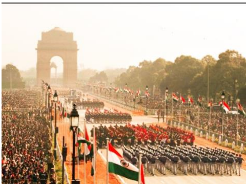
7) Republic Day