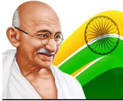
10) Gandhi Jayanti