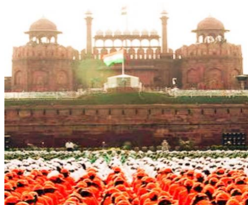
8) Independence Day